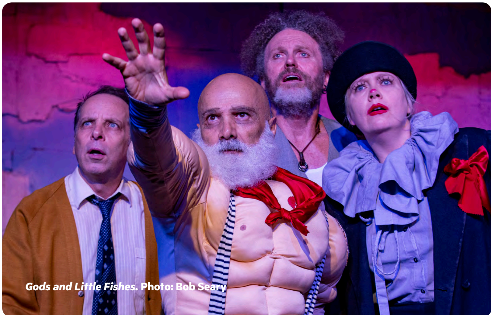
Gods and Little Fishes.