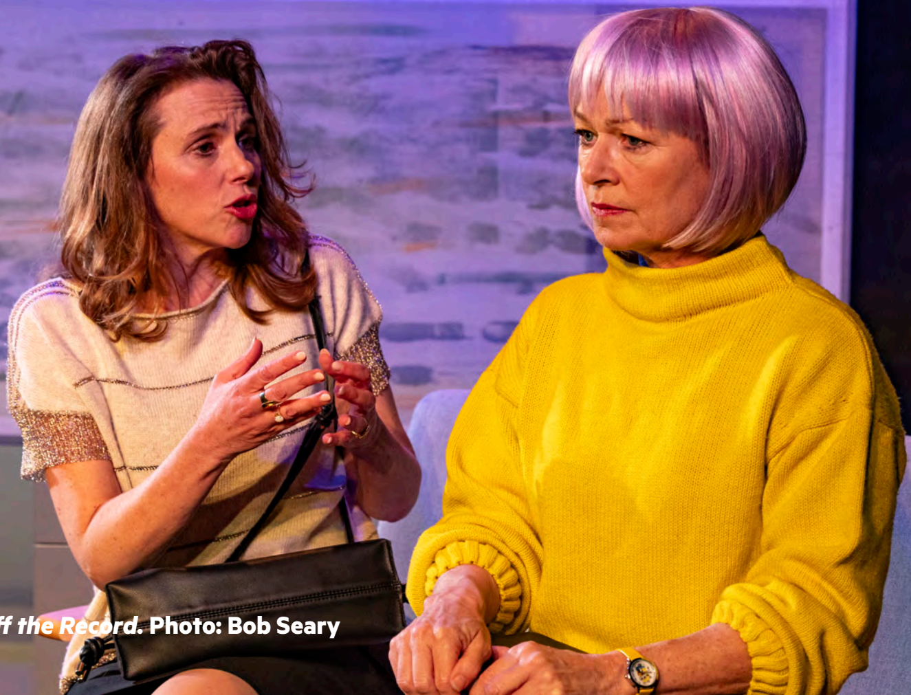
Off the Record.